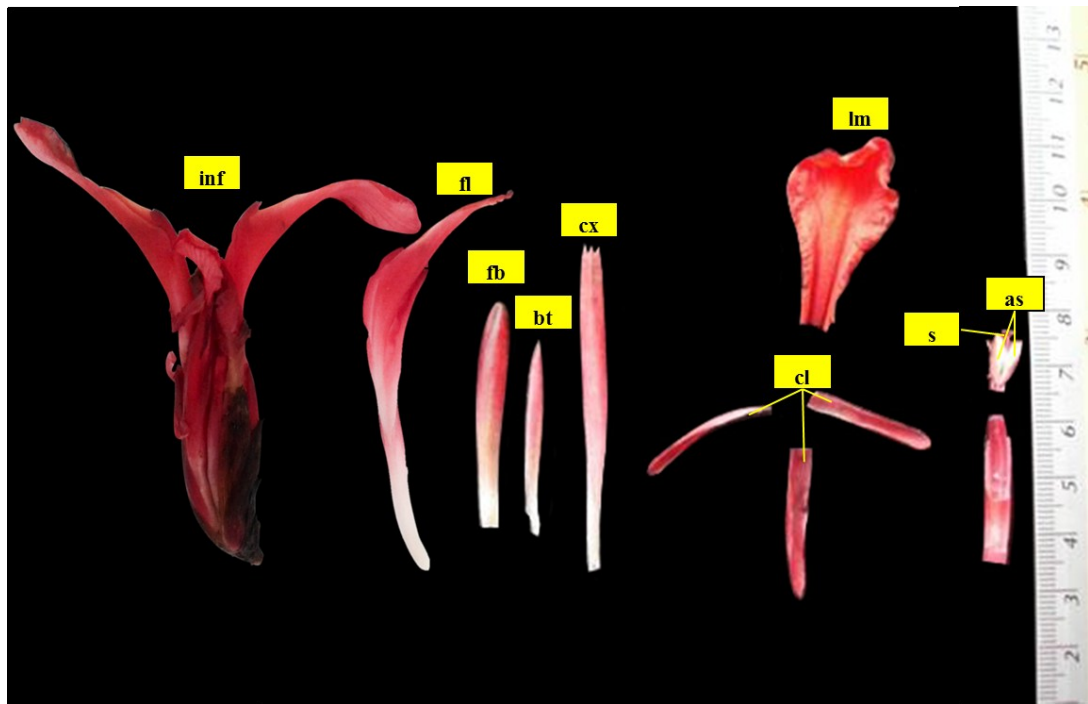
Figure 2: Etilingera philippinensis Floral Dissection: inflorescence (inf), flower (fl), fertile bract (fb), bracteole (bt), calyx (cx), corolla lobes (cl), labellum (lm), stigma (s) and anther sacs (as).